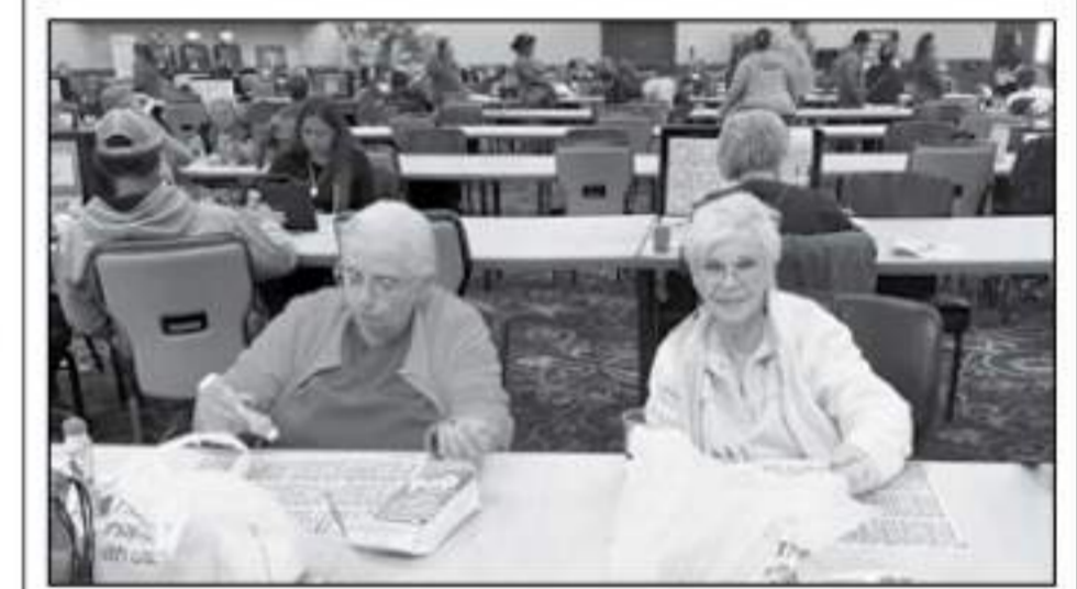
Bingo players excited to be a part of Arizona Charlie's Sweetheart Bingo last month.