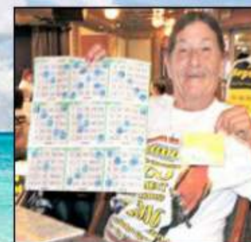
SAILING FROM ORLANDO, FL.