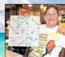
SAILING FROM ORLANDO, FL.

NOVEMBER 1 - 9, 2025 CALL TODAY... CABINS ARE FILLING FAST!