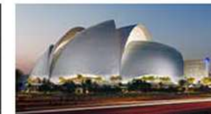
Design by BIG/Image by Negativ