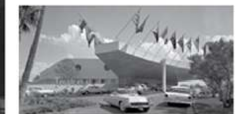
Tropicana Las Vegas 1957 Exterior

More information about Bally's Corporation is available at www.ballys.com and on Instagram at @ballyslasvegas , and more information about the Athletics is available at www.athletics.com and on Instagram at @athletics .