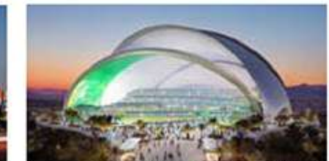
Design by BIG/Image by Negativ