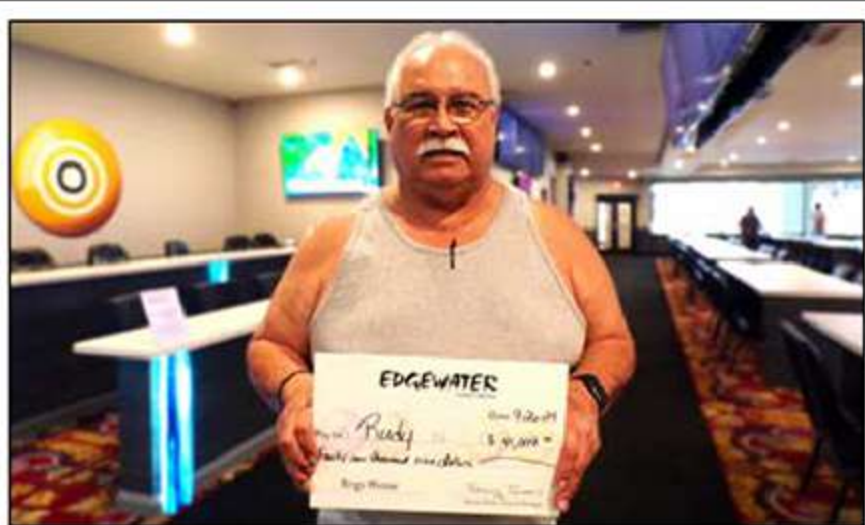
Laughlin Local Takes Home More than $41,000 After Winning Double Progressive Jackpot at Edgewater Casino Resort

LAUGHLIN, Nev. - Oct. 3, 2024 - The Bingo Room at Edgewater Casino Resort has once again paid out a massive Double Progressive jackpot of $41,009 to a lucky player, this time a local resident of Laughlin.