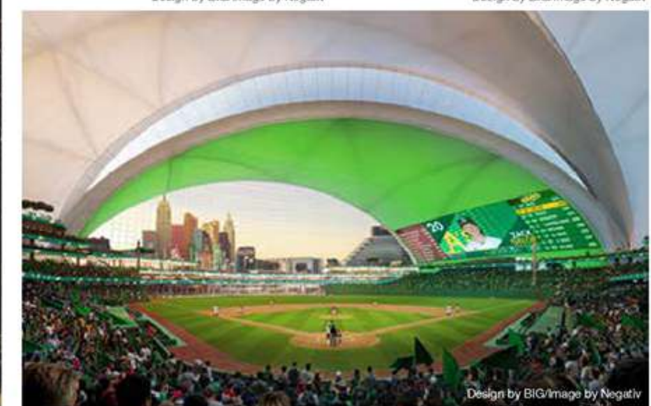
Design by BIG/Image by Negativ