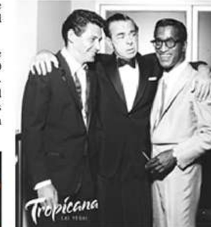
Eddie Fisher, Eddie Cantor and Sammy Davis Jr. at the Tropicana in 1958