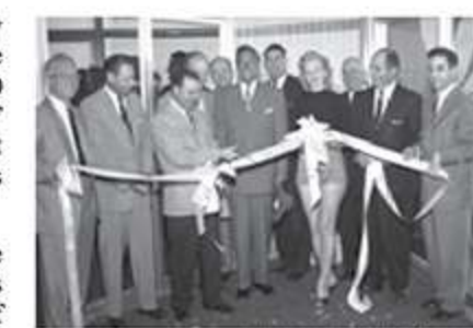
Ribbon-cutting ceremony for The Tropicana Las Vegas in 1957